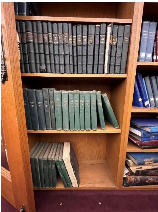
Archives of District GL of China 中國區總會會議報告