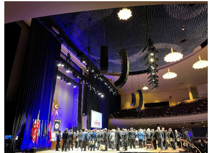
大會禮堂及舞台 Auditorium and Stage